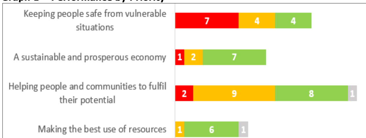
Graph 1 – Performance by Priority