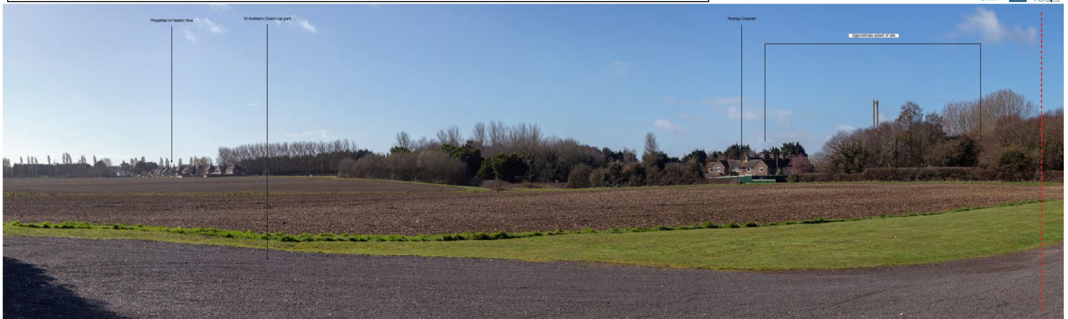
Viewpoint 23 from car park of St Andrew's Church, Ford looking west toward site Visualisation type 4*. To be viewed at a comfortable arm's length and printed at A1 * Refer to Technical Appendix H for visualisation details