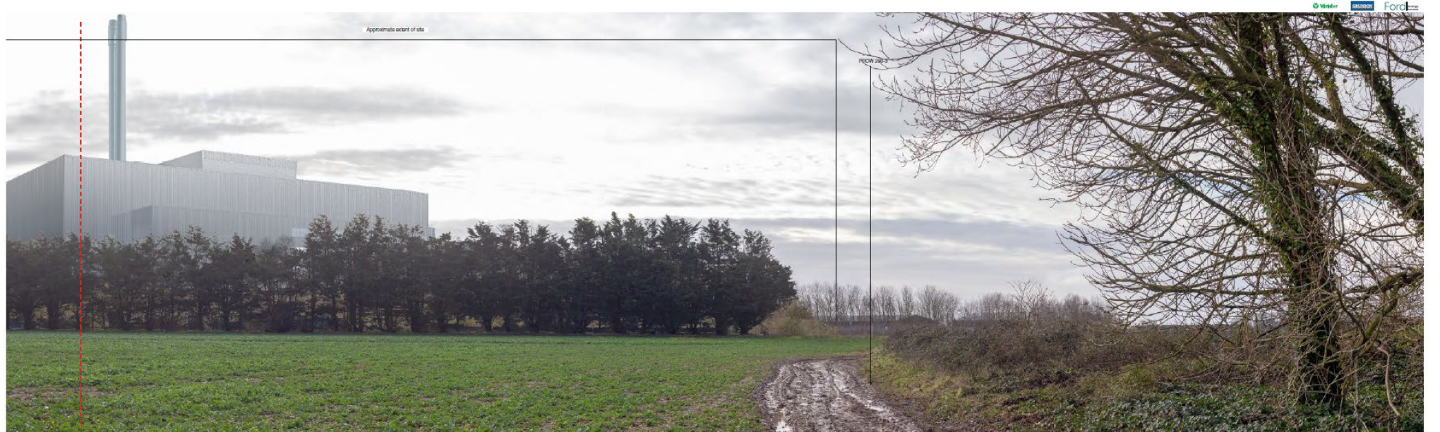
Viewpoint 37 from PROW 200-3 north west of site, looking south east towards the site (continued) Visualisation type 4*, to be viewed at a comfortable arm's length and printed at A1 * Refer to Technical Appendix H for visualisation details