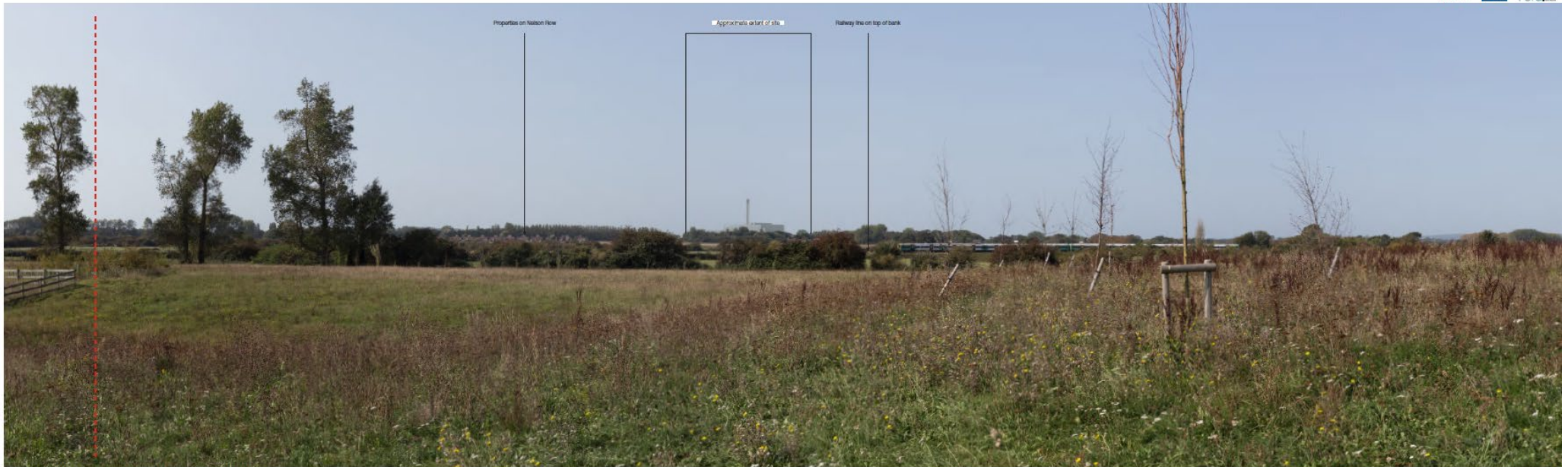
Viewpoint 02 from POS on west side of Littlehampton looking west toward site (continued) Visualisation type 4*. To be viewed at a comfortable arm's length and printed at A1 * Refer to Technical Appendix H for visualisation details.