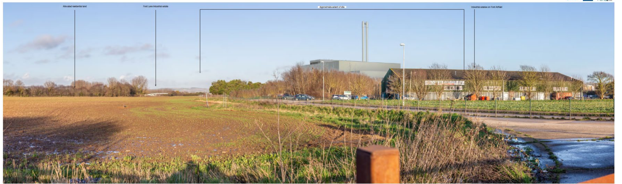
Viewpoint 10 from Rollaston Park looking east toward site Visualisation type 4*, to be viewed at a comfortable arm's length and printed at A1 * Refer to Technical Appendix H for visualisation details