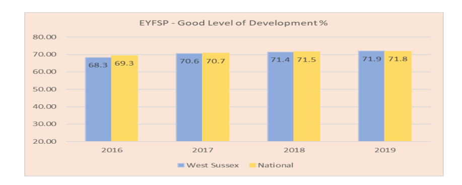
Table 1: Proportion of 5 yr olds reaching a GLD at the end of the Foundation Stage

2.1 The last publicly captured data indicated that the proportion of children in the Early Years Foundation Stage reaching a good level of development by the age of 5 was in line with the national average. This had been so over the three years prior to the covid pandemic.