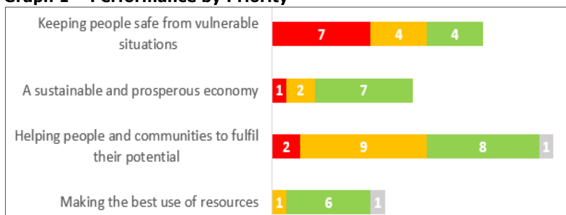
Graph 1 – Performance by Priority