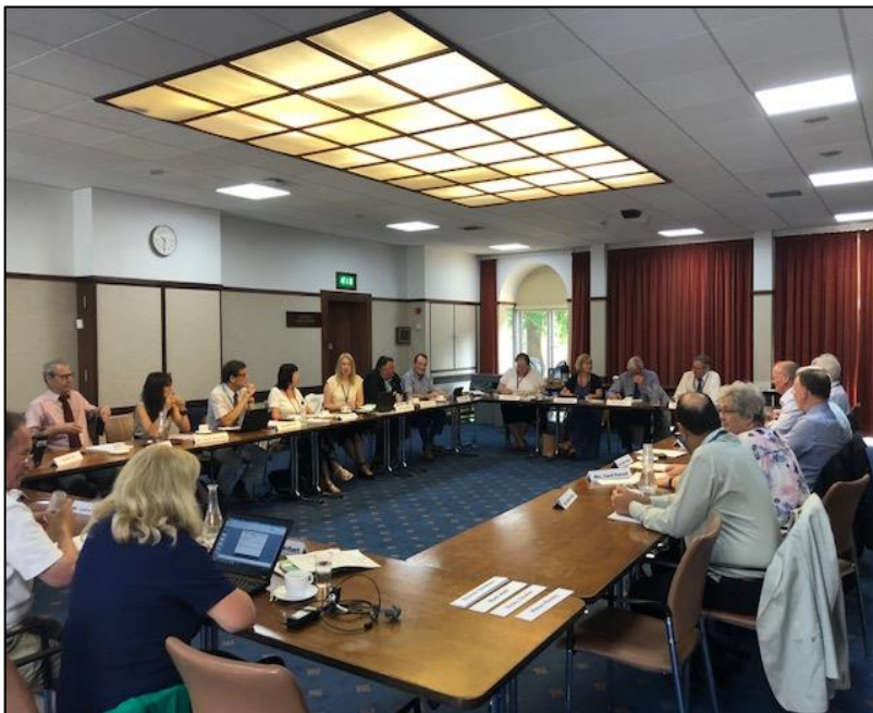
A scrutiny committee meeting in action